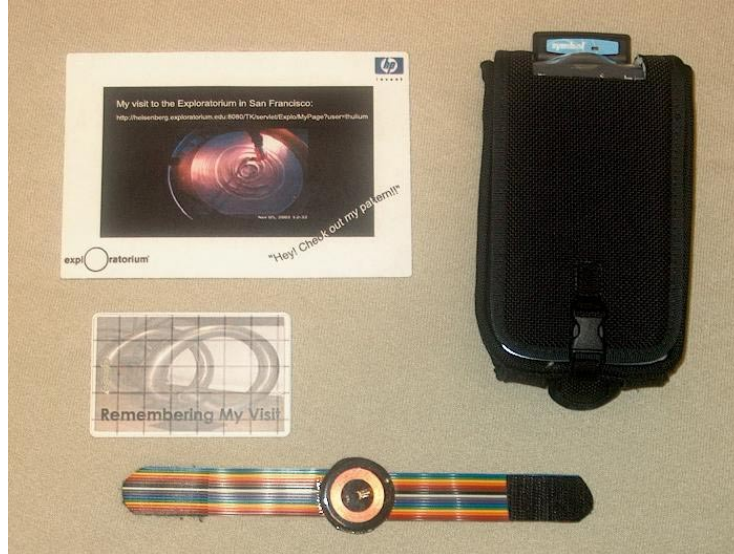
Fig. 1. A ‘reminder’ fridge magnet (top left) and ‘remember-this’ technologies: an RFID card and ‘wristwatch’, and a PDA in a case that receives and invokes beacons URLs.

record consists of Web pages about the visited exhibits, including real-time photographs and typed notes. It is intended to provide a starting point for later exploration, discussion and reflection on the observed phenomena. It is aimed particularly at those visitors whom we found to be overwhelmed by the vast amount of information presented in the museum.